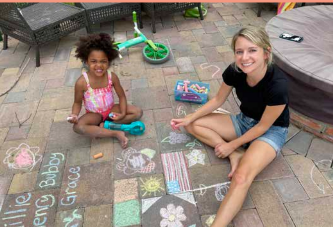
Sidewalk artwork on the 4th of July