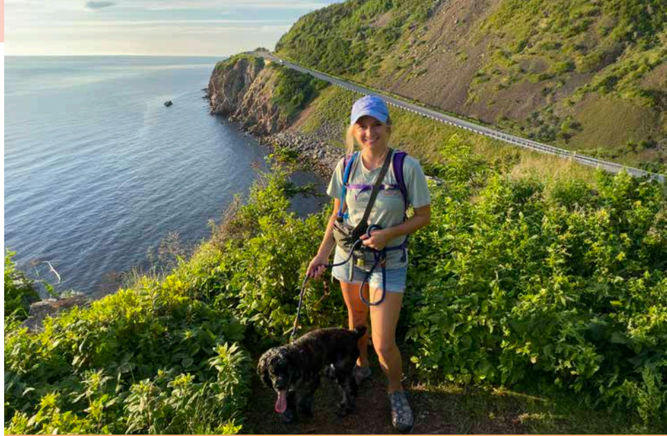
Hiking the rugged coastline of Nova Scotia