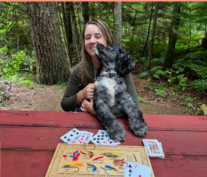
Cribbage around the campfire is a favorite summer pastime