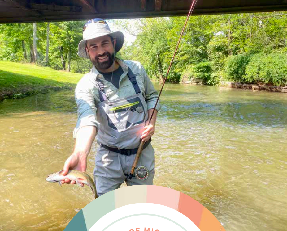
Fly fishing for trout