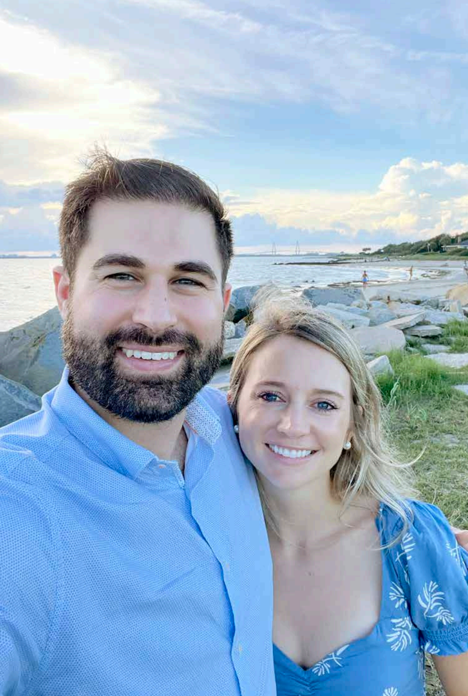
Being tourists in Chicago, the first city we called home