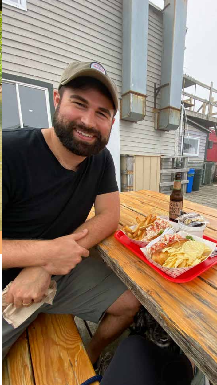
Enjoying fresh Maine lobster at our favorite spot