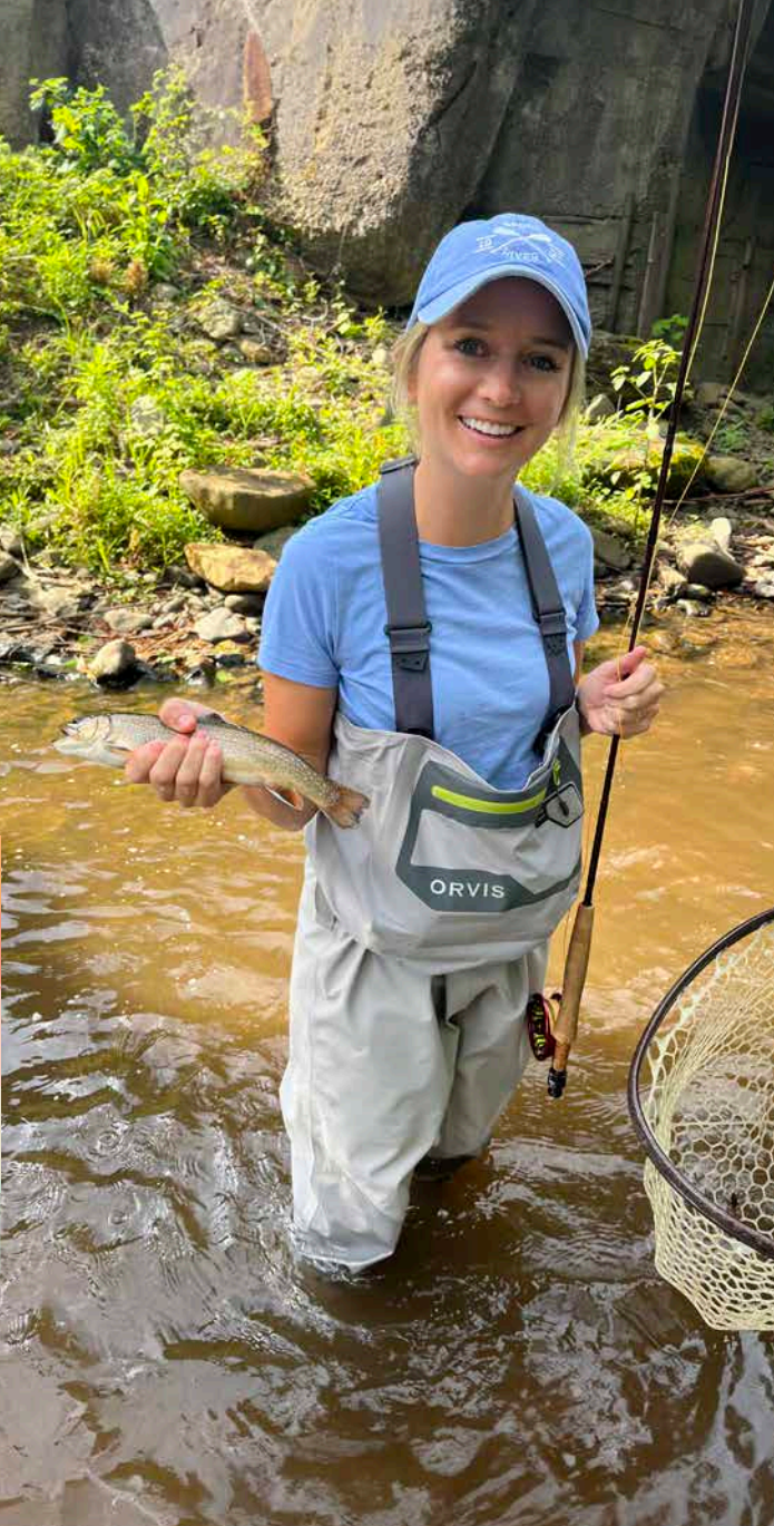
Fly fishing on the river