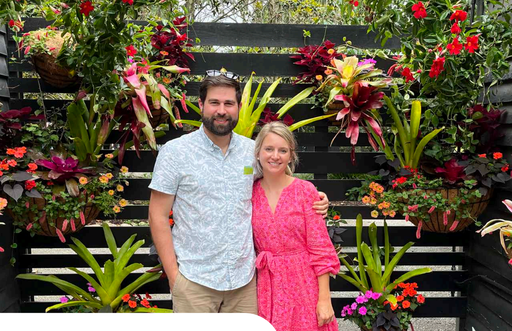
Springtime in the botanical gardens