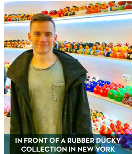
IN FRONT OF A RUBBER DUCKY COLLECTION IN NEW YORK