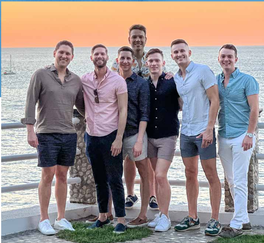
FRIENDS TRIP TO PUERTA VALLARTA