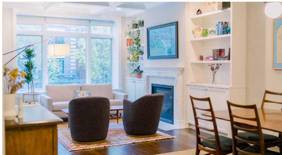
OUR LIVING ROOM AND DINING ROOM