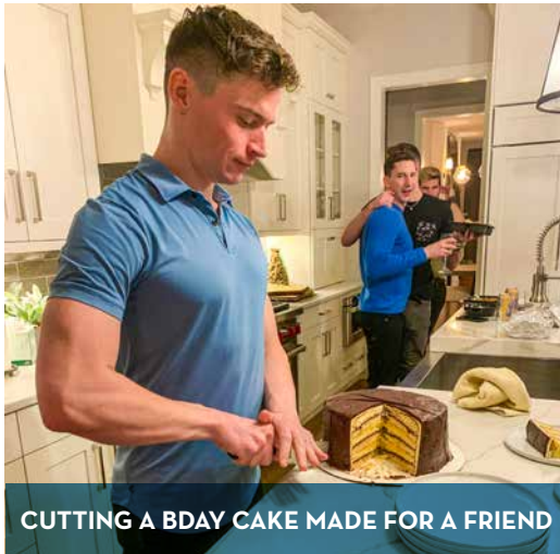
CUTTING A BDAY CAKE MADE FOR A FRIEND