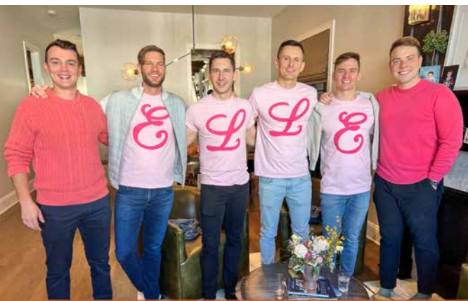
BABY SHOWER FOR OUR FRIENDS

WE ARE ALSO LUCKY TO HAVE AN AMAZING "CHOSEN FAMILY" OF CLOSE FRIENDS THAT LIVE NEAR US IN CHICAGO.