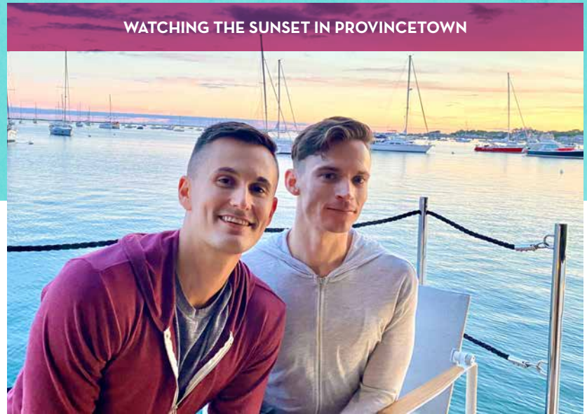
WATCHING THE SUNSET IN PROVINCETOWN