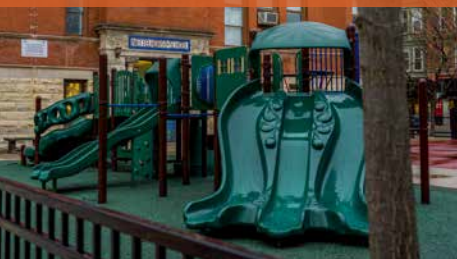
SCHOOL DOOR ON OUR BLOCK