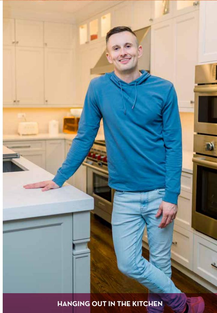
HANGING OUT IN THE KITCHEN