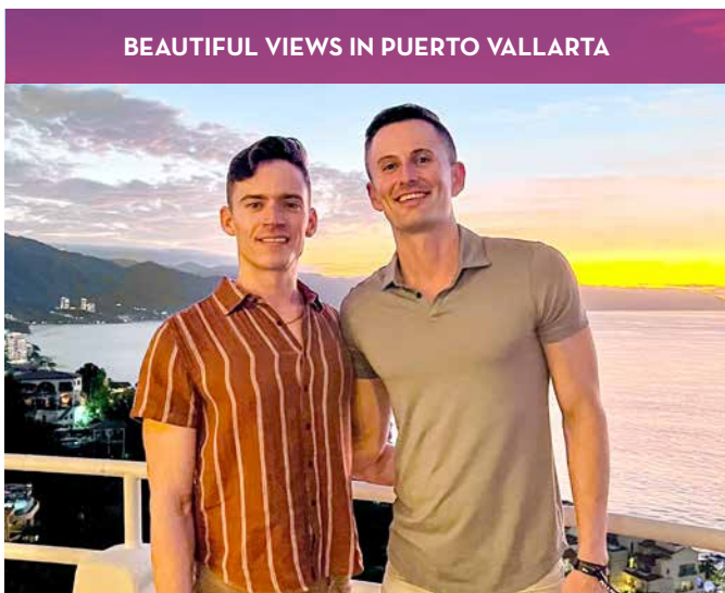
BEAUTIFUL VIEWS IN PUERTO VALLARTA