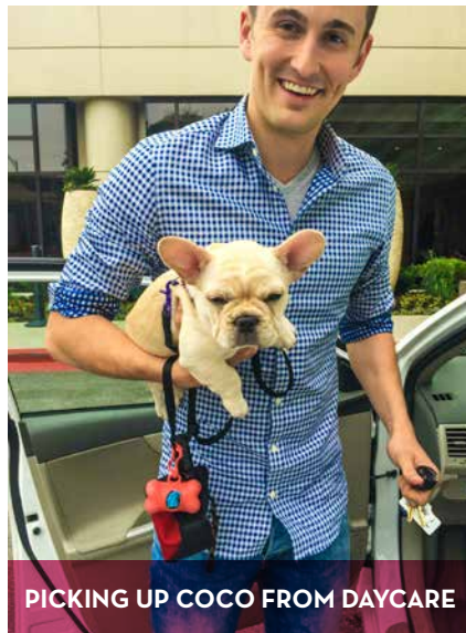
PICKING UP COCO FROM DAYCARE