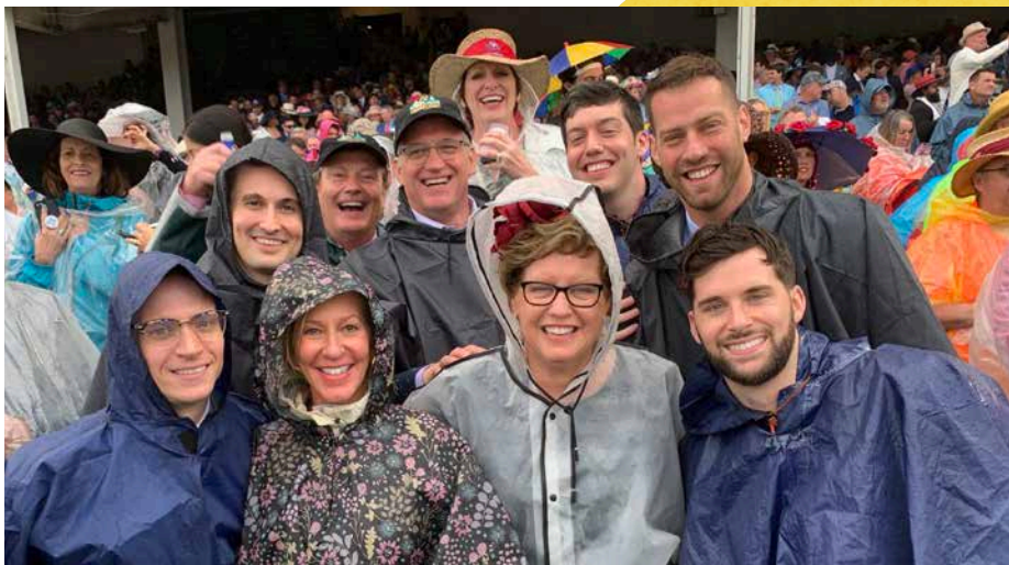
KENTUCKY DERBY WITH FRIENDS