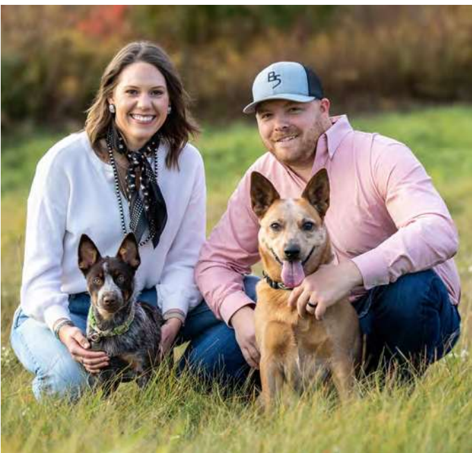
MINNIE + HONEY