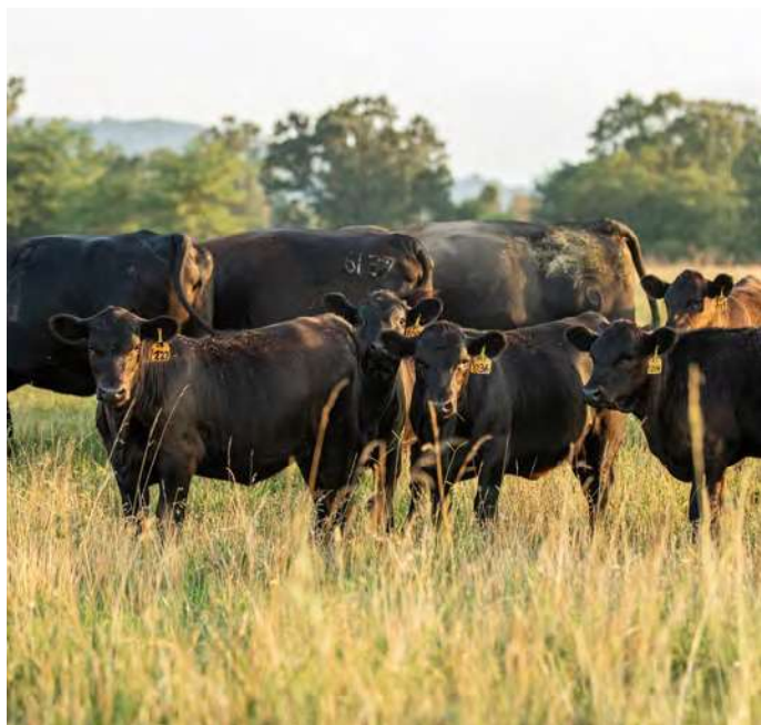
OUR VARIOUS FARM ANIMALS