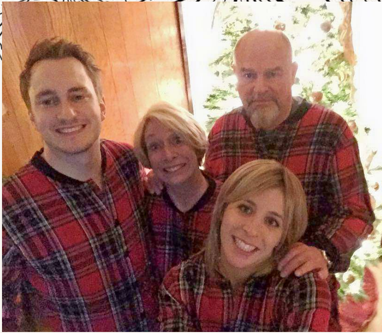
Christmas with Mom and stepdad