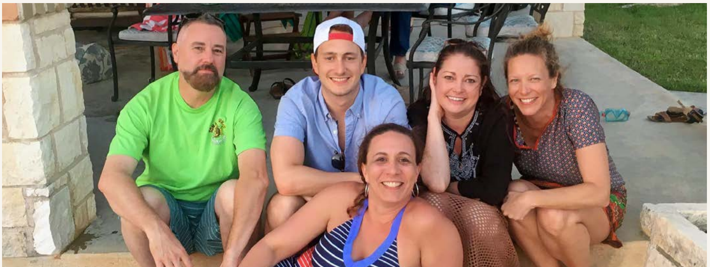
Sitting by the pool with my older brother and three older sisters