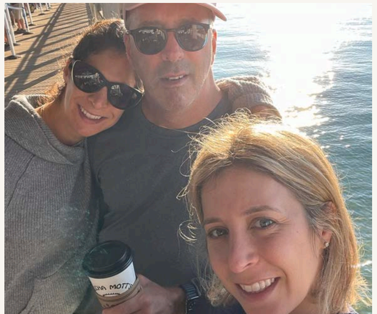
Hanging out with Dad