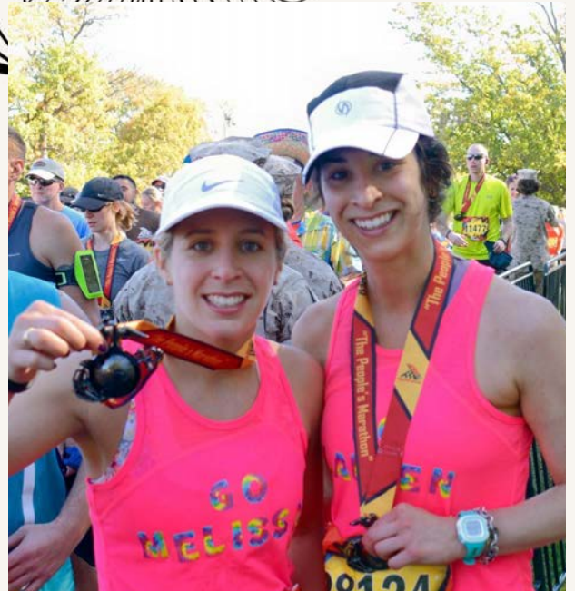
Running the DC marathon