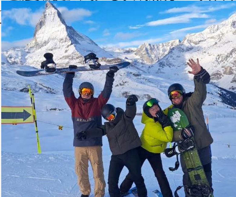
Skiing in Switzerland with friends