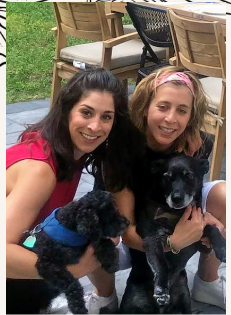
My sister and our dogs