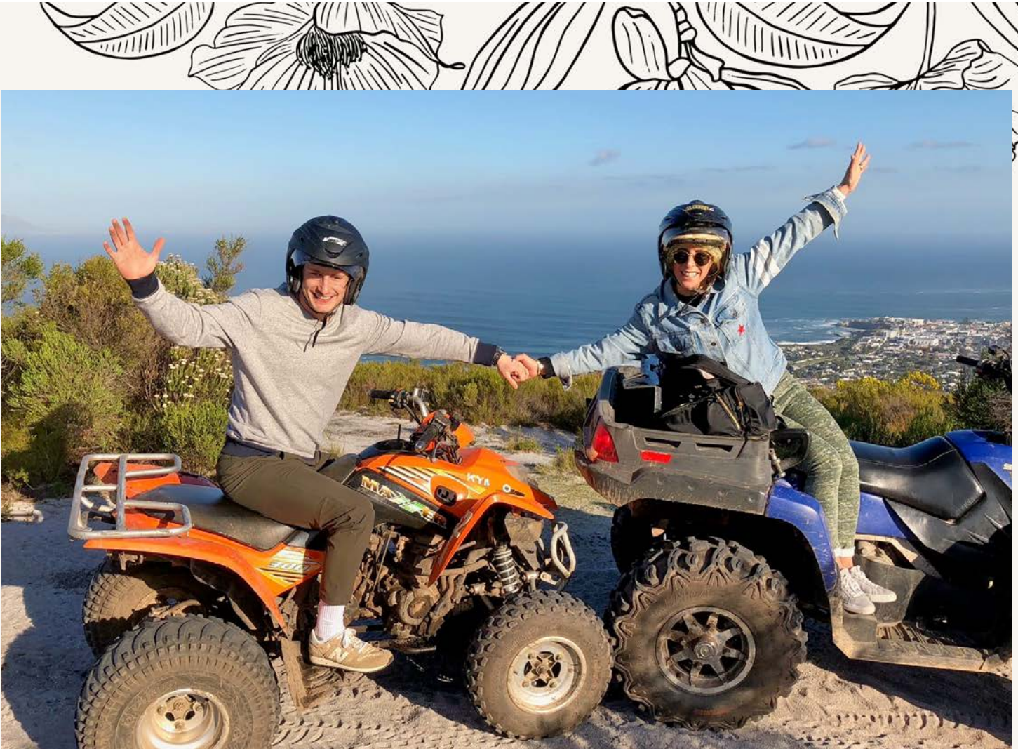
ATV tour in South Africa for our honeymoon