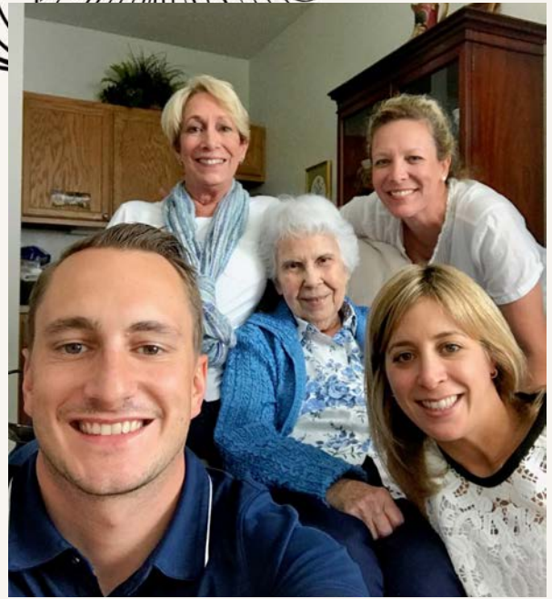
My maternal grandmother