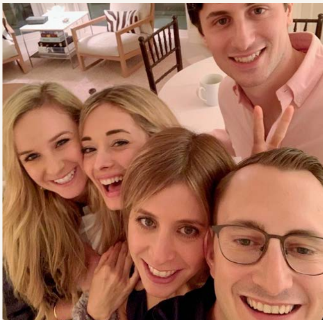
More cousins in Florida