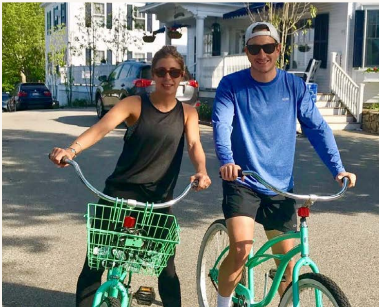
Riding bikes in Maine