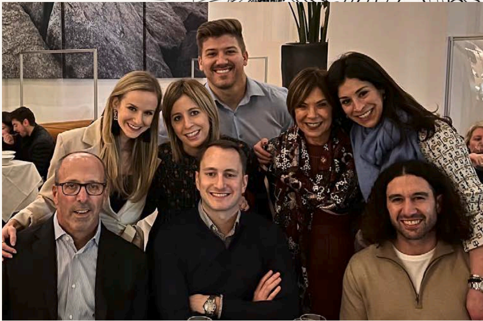
Family dinner with the cousins